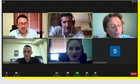
4/8/2021 - Creative@Hub Agrinio Business meeting with "ATRAPOS" Mountain Alternative Tourism and Aetolian Development