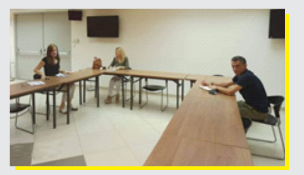
3/8/2021 - Creative@Hub Agrinio Business meeting with the Interim President of the Association of the Network of Cultural Associations of the Kallikratikos Municipality of Agrinio