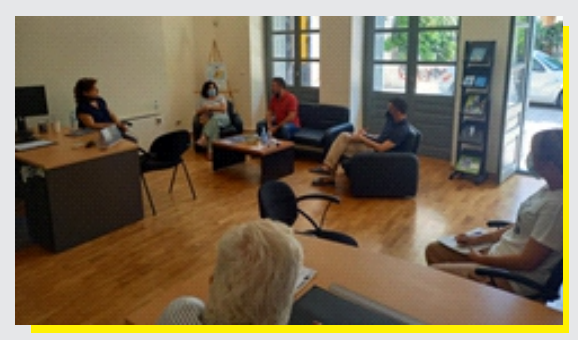
27/7/2021 - Creative@Hub Messolonghi Business meeting with the Ephorate of Antiquities of Aetolia and Lefkada