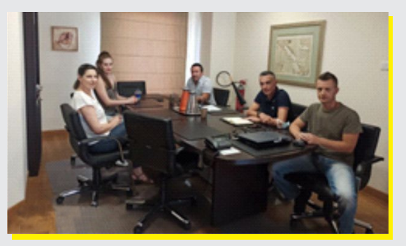
5/8/2021 - Creative@Hub Agrinio Business meeting with the President of the cultural association "Agia Skepi"

Also, from the beginning of the program until today have been held a total of 15 business meetings in Agrinio and Messolonghi either live or via video conference, with cells of the cultural industry such as institutions, associations, professionals, organizations, etc. This strategy was followed with the aim of developing synergies and maturing targeted seminars-workshops. The successful outcome of the business meetings led to the organization of three of the 24 seminars-workshops that aim to transfer experiences, knowledge, techniques, strategies, innovative practices and models in order to develop the cultural industry of the region. In addition, the business meetings that took place have already resulted in the planning of the next six seminars-workshops that took place in October, while at the same time workshops continue aimed at developing synergies and disseminating the work of CREATIVE@HUBS.