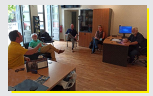
14/6/2021 - Creative@Hub Messolonghi Business meeting with "Polis Production" and the "Philo-artistic Association of Messolonghi"